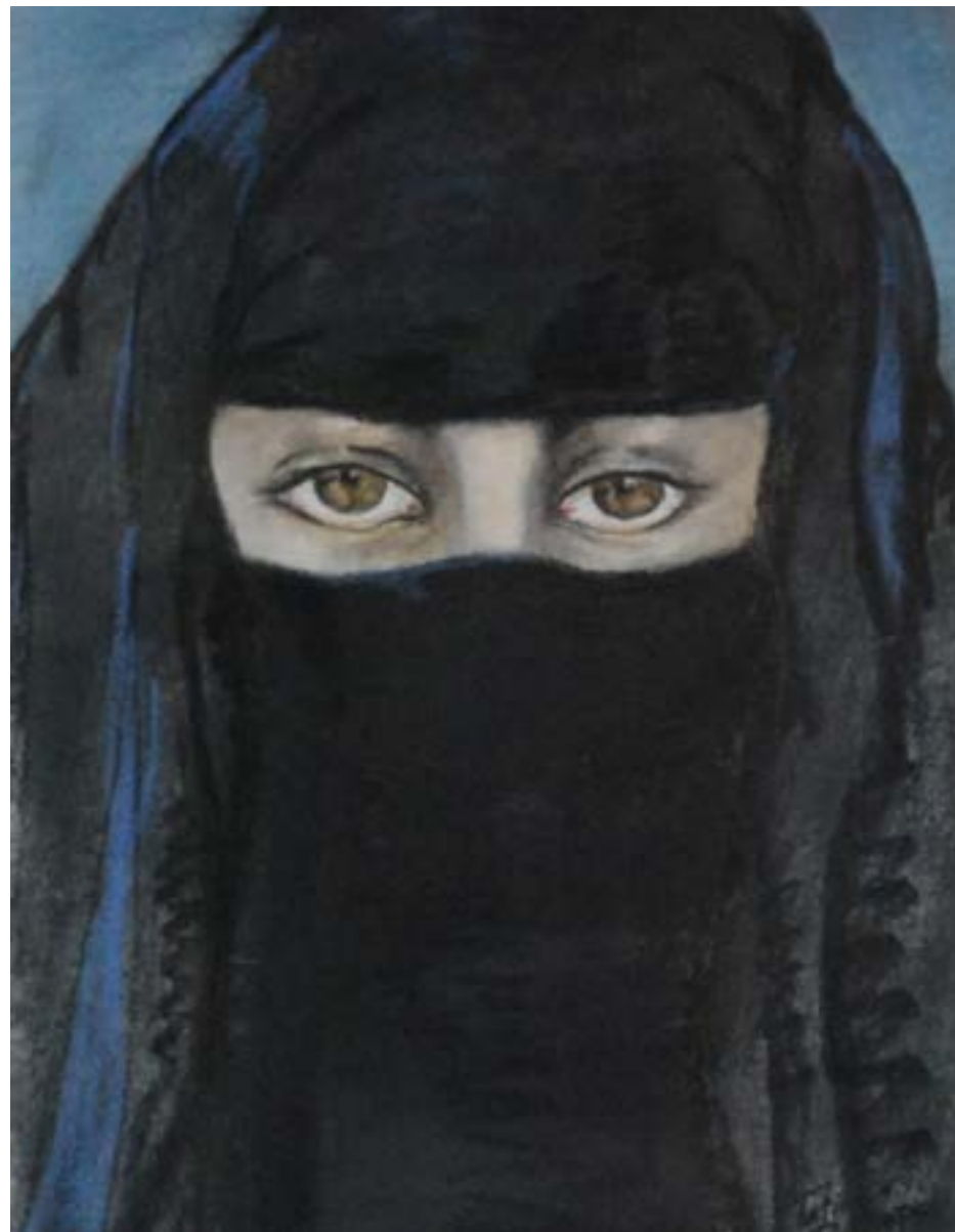
THE CAPTIVE PRINCESS

THE CAT WOMEN: WOMEN EM- POWERED AND WITH CLAWS TO FIGHT FOR A BETTER WORLD.