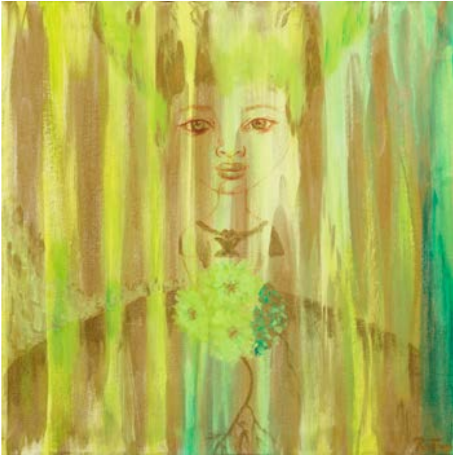
GOLD AND GREEN