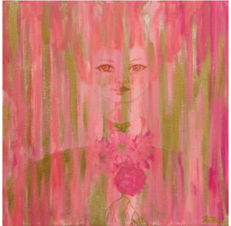
GOLD AND PINK