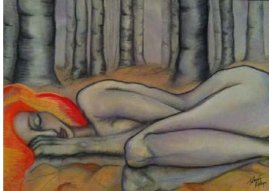
THE DREAM OF THE BEAUTY PRINCESS